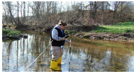
Volunteers are at the heart of our organization. If you are interested in sharing your skills, or learning new ones, please contact FLMR

To pursue this mission, Friends of Lower Muskingum River, Inc. was established as a 501(c)(3) IRS-qualified non-profit corporation.