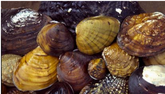
The Muskingum River contains some of the largest and most diverse mussel beds in the United States.