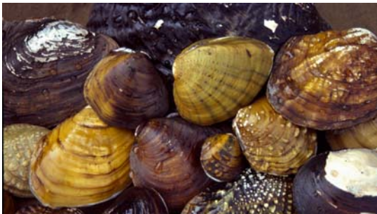
The Muskingum River contains some of the largest and most diverse mussel beds in the United States.